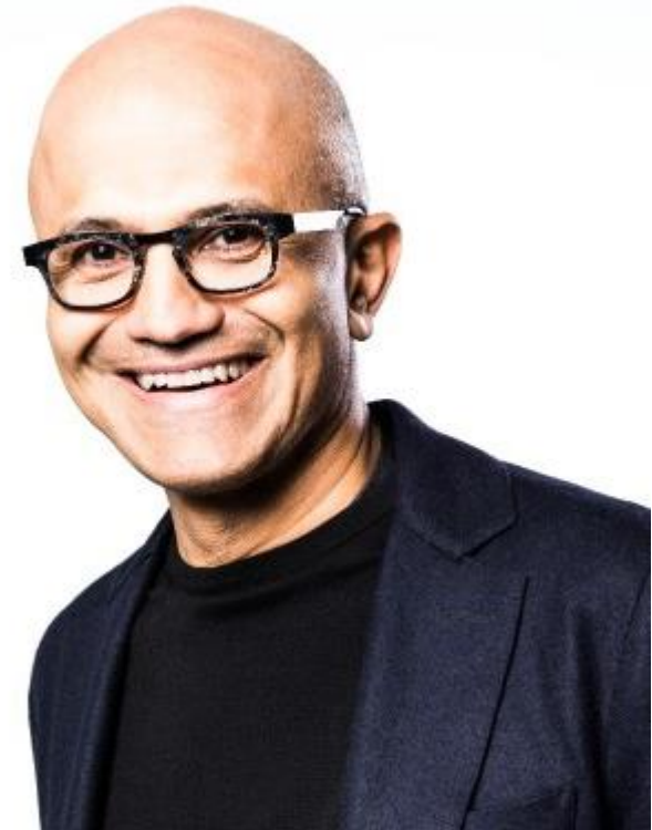
Satya Nadella Chairman and CEO at Microsoft